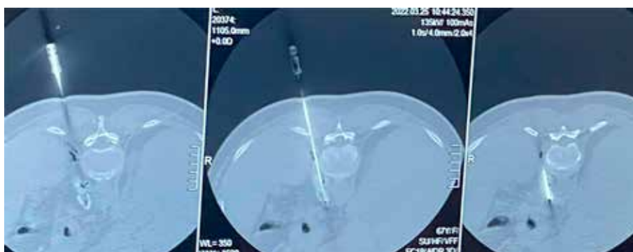
Fig. 5. Contrast was injected to confirm the needle position, then 20 ml of 70% ethanol was slowly injected. Free diffusion of the neurolytic agent is visualized antecrucially to the right and in front of the aorta and the celiac trunk - the location of nodes of the celiac plexus

chylothorax, chemical pericarditis, pleuritis or peritonitis, gastroparesis, superior mesenteric vein thrombosis, aortic dissection, aortic pseudoaneurysm, transient hematuria, retroperitoneal abscess or fibrosis, pulmonary embolism, bacteremia [16– 18].