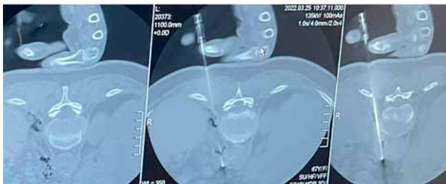
Fig. 4. Sympatholysis using a right-sided posterior paravertebral antecrucial CT-guided approach. Gradual advancement of the needles to the lateral and anterior surface of the aorta at the level of the celiac trunk (Th12–L1 level to the right)