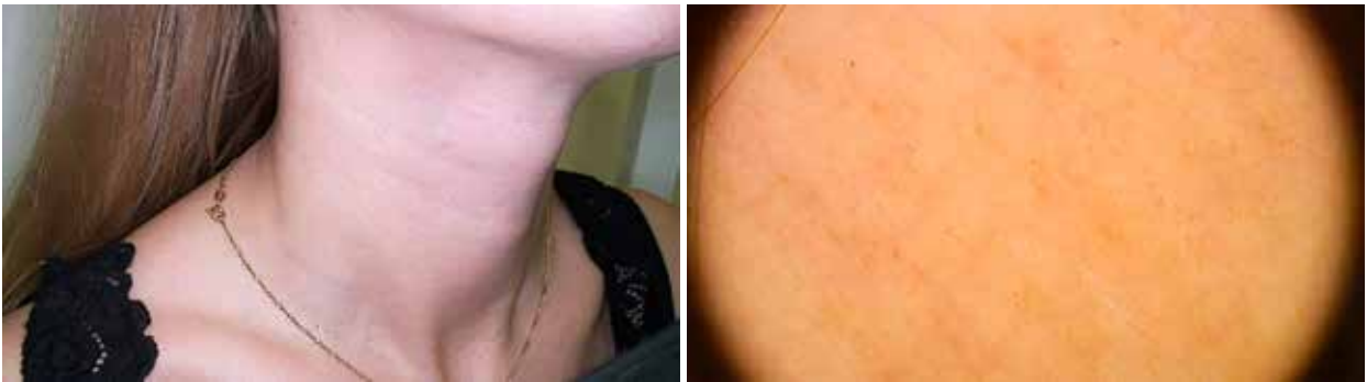
Fig. 4. Capillaroscopy of patient K. after surgery (neck area). No prolonged erythema, normal diameter and shape of skin capillaries. The capillaroscopic picture is within the normal range for this anatomical area