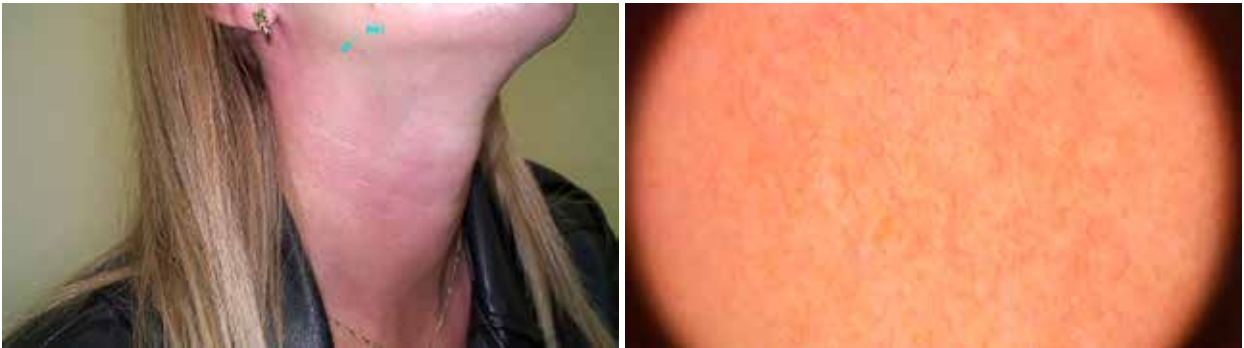
Fig. 3. Capillaroscopy of patient K. before surgery (neck area). Multiple uniformly dilated capillaries against a prolonged erythematous background. Moderately tortuous capillaries, stagnant drops in curls, pronounced perivascular edema, venous insufficiency of the 1st degree