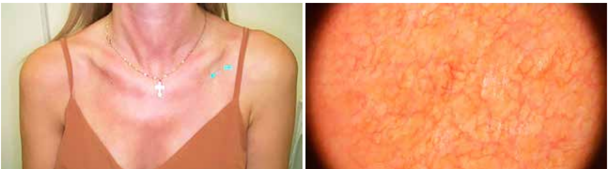
Fig. 5. Capillaroscopy of the patient K. before surgery (chest area). Reticular vascular pattern on a prolonged erythematous background. Multiple telangiectasias. Secondary hyperpigmentation, represented by a pigmented pseudo grid