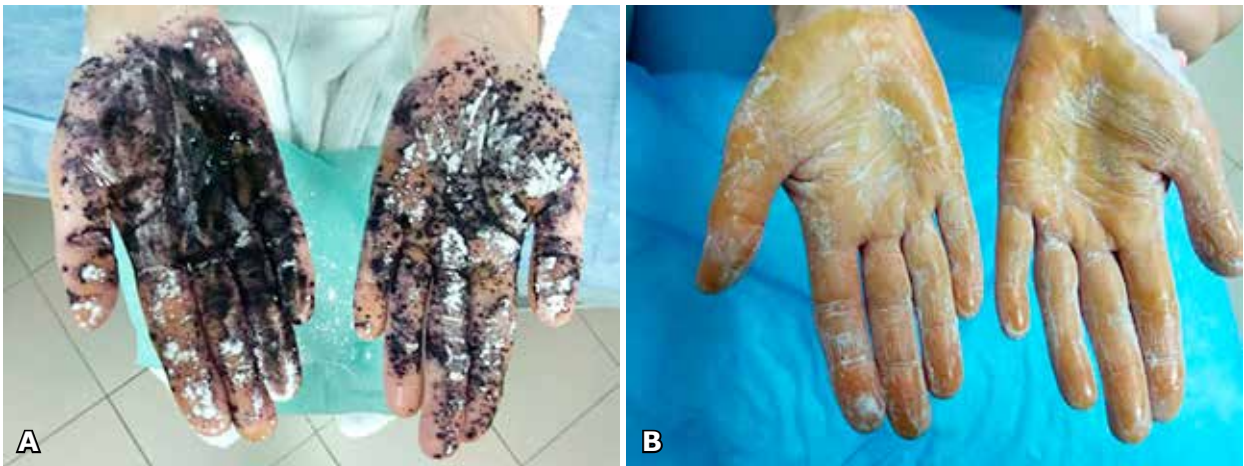
Fig. 8. Minor test in a patient with bilateral hyperhidrosis on the palms before (A) and after (B) surgery

result was obtained - all patients were satisfied with the achievement of a quick effect.