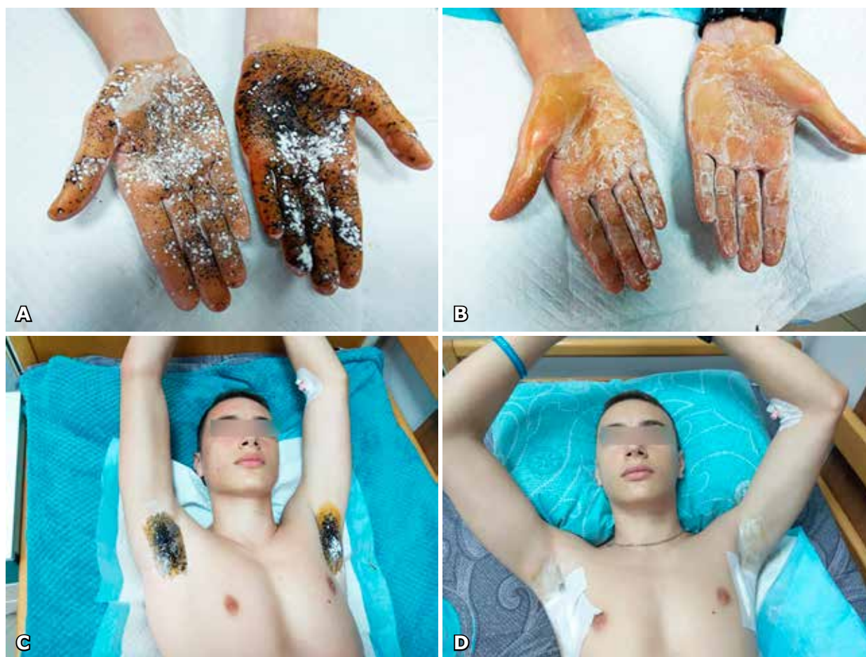
Fig. 7. Minor test in a patient with bilateral hyperhidrosis in the palms and axillary region: palms before (A) and after (B) surgery; armpits before (C) and after (D) surgery

Gravimetric analysis: on the right palm the result before surgery - 2.17 g, after surgery - 1.85 g, on the left palm the result before surgery - 2.11 g, the result after surgery - 1.78 g.