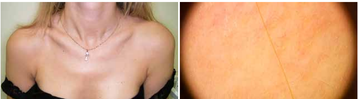
Fig. 6. Capillaroscopy of the patient K. after surgery (chest area). Clusters of reticular capillaries. No prolonged erythema. The capillaroscopic picture is within the normal range for this anatomical area. Uneven mild secondary skin hyperpigmentation