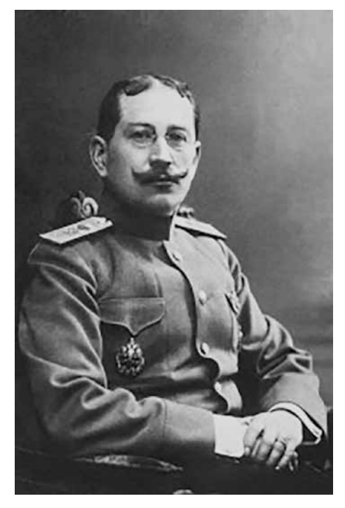
Fig. 1. Professor of the Military Medical Academy O.O. Maximow, 1910

000, forcing scientists to look for alternative sources of hematopoietic SC. A scientific breakthrough occurred in 1974 after the discovery of S. Knudtzon that umbilical cord blood in large quantities contains the same hematopoietic SC as the BM.